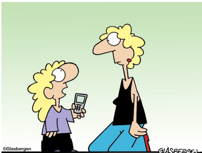
“If I send my prayer as a text message, will I get a faster reply?”

Please continue to support the mission of the church. You can use this image below by scanning the QR Code with your smart phone's camera which will lead you to our Website for Online Giving or look for our new Paypal button on our Facebook page!